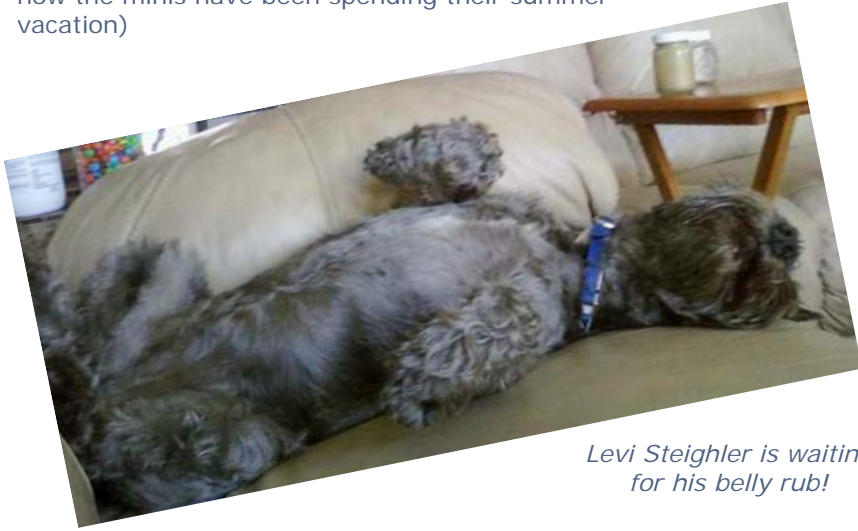
Levi Steighler is waiting for his belly rub!

Here are some pictures to make you smile! (and see how the minis have been spending their summer vacation)