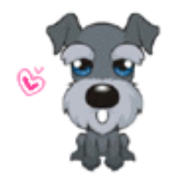
There he is...